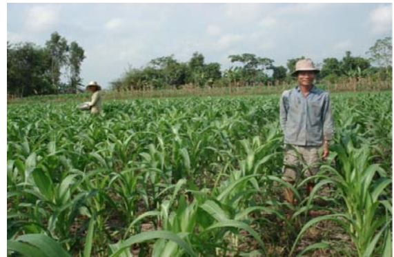
ICM at 40DAS