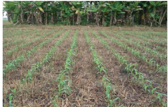
ICM at 10DAS