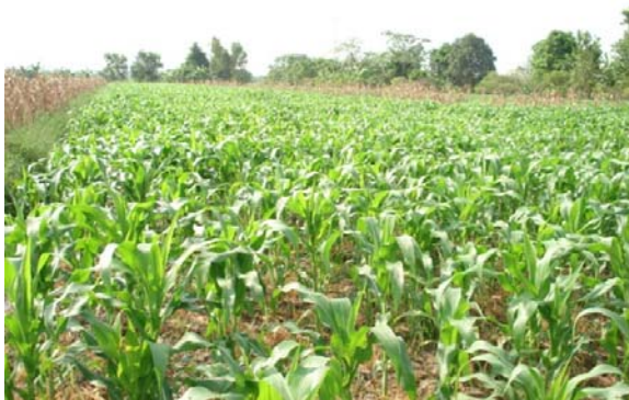
FP at 40DAS