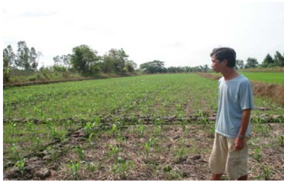
FP and ICM at 10DAS