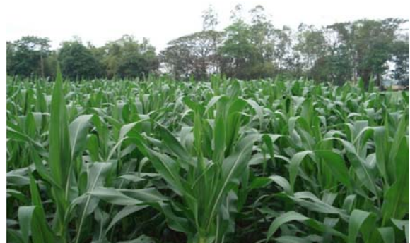
ICM at 65DAS