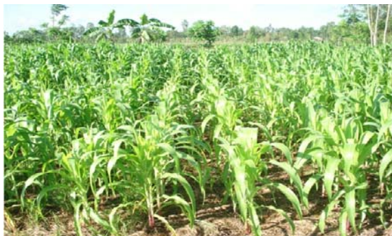
FP at 65DAS