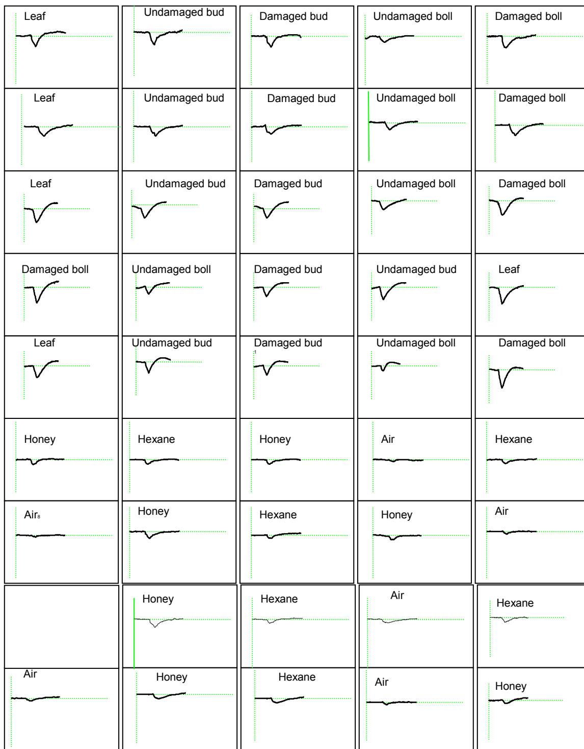
Plate 1. EAG responses of females of A. angaleti to synomonal extracts of cotton variety LD 327 (Repeated with 5 individual wasps)