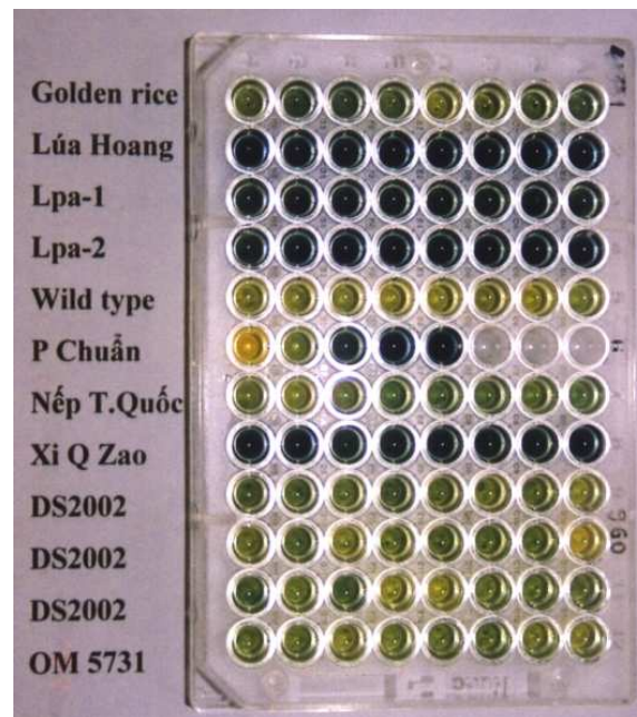
Figure 1. Assay for free phosphate (HIP phenotype) in some varieties. Single seeds from a given panicle were crushed, extracted and assayed for free P based on colorimetric molybdenum staining assay. To allow for direct comparison, 100mg of flour were extracted in 10 vol. of HCl 0.4 N and an equal aliquot vol. was tested. The standards contained 0.0 \mu\text{g P} ; (ii) 0.155 \mu\text{g P} ; (iii) 0.465 \mu\text{g P} ; (iv) 0.930 \mu\text{g P} and (v) 1.395 \mu\text{g P} .

In the case of high phosphate content, a dark-blue coloured phosphomolybdate complex formed in 2 hours. Putative lpa mutant grains were scored for phytate and orthophosphate levels using TLC analysis as described by Rasmussen and Hatzack (1998).