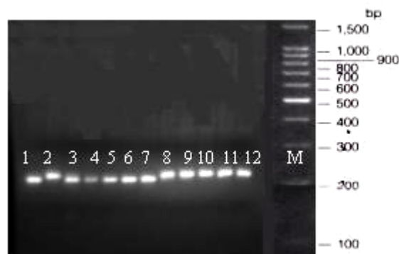
Figure 3. Banding patterns of the SSR marker RM207 for LPA

The advent of marker-assisted selection permits rapid identification of individuals that contain genes for low phytic acid. The presence or absence of the associated molecular marker indicates, at an early stage, the presence or absence of the desired target gene. Segregating populations were used to confirm co-segregation between SSR markers and the gene for LPA. Polymorphic marker RM207 detected LPA in OM1490 mutants (Figure 3). Lane 1 (IR 64) exhibited band of 200 bp and lane 2 showed Lpa-1 at 220 bp. Lane 3-7 presented high phytic acid from wild type OM1490, lane 8-12 indicated LPA of landraces as Nep than, Nep hạt to, Nep ao vang, Nep thom and Nep mau luon.