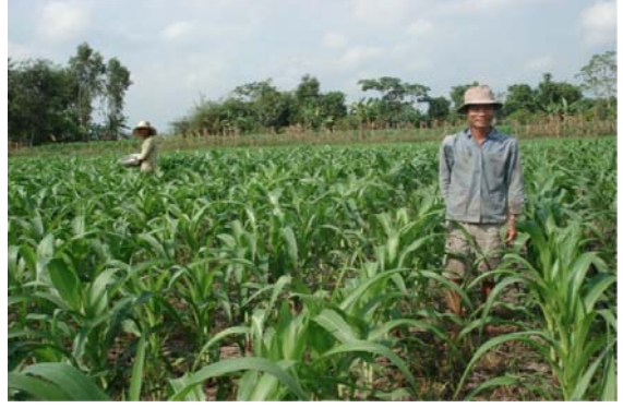
ICM at 40DAS