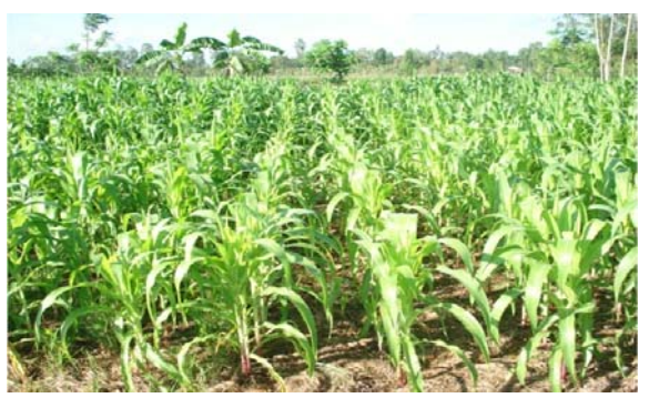
FP at 65DAS