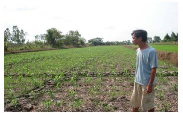
FP and ICM at 10DAS