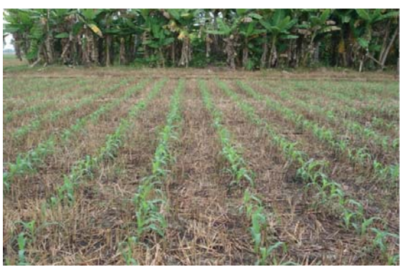
ICM at 10DAS